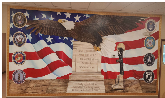
Mural on meeting room wall hand painted by Air Force veteran Tony Clubine.